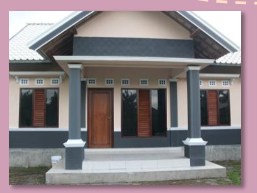
"The beautiful house"; an example of house construction from money raised by working in Saudi Arabia. We were told it cost IDR 250 million